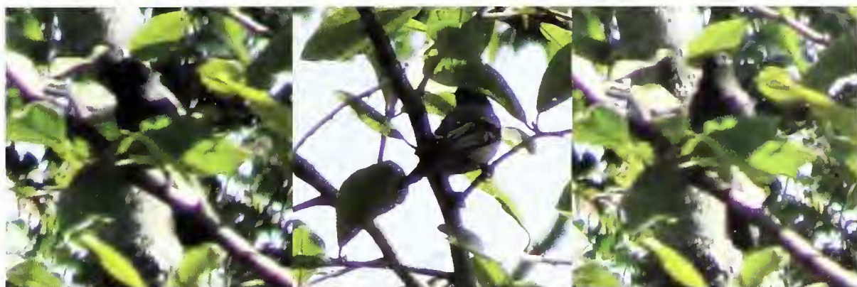
Figure 2. Rufous-bellied Tits Melaniparus rufiventris pallidiventris , Itulu Hills, western Tanzania, 27 January 2011